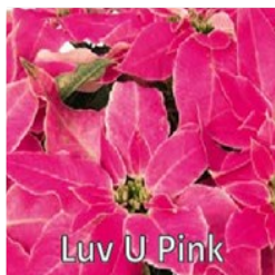
Luv U Pink