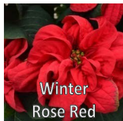
Winter Rose Red